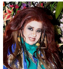
By: Shahnaz Husain

Comedones, also known as "Strawberry legs" is a term used for dark spots that appear on the legs. This name owes its origin to the fact that the dark spots look like strawberry dots. According to a dermatologist, "Strawberry legs occur when enlarged pores or hair follicles trap dead skin, oil, and bacteria. A person often experiences strawberry legs following shaving. Other skin conditions that can cause