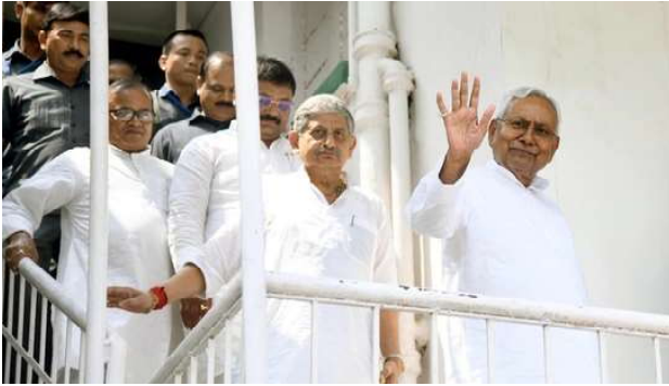
Bihar Chief Minister Nitish Kumar visits Janata Dal United (JDU) office ahead of party's national council meeting, in Patna.

Mr Kumar's close aide and JD(U) national President Rajiv Ranjan Singh then hit back, asking Mr Modi not to "daydream" and dared him that the BJP would be wiped out in 2024 Lok Sabha elections. He accused the BJP of not adhering to coalition "dharma" in Arunachal Pradesh, where all seven of its MLAs have now merged with the ruling party, and pointed out that PM Modi after 42 rallies could win only 53 seats in the 243-strong